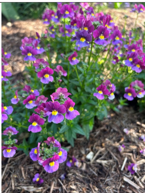
Nemesia fruticans 'Aromance Mulberry'

A compact, trailing plant known for its stunning, soft blue flowers. It features delicate, rounded, deep green foliage that complements the vibrant blooms. This variety is particularly appreciated for its long-lasting, profuse flowering and ability to tolerate a range of weather conditions, thriving in full to partial sun. The plant's attractive colour contrast and spreading nature add a refreshing touch to gardens and landscapes. We love it in our hanging pots. It also comes in pink!