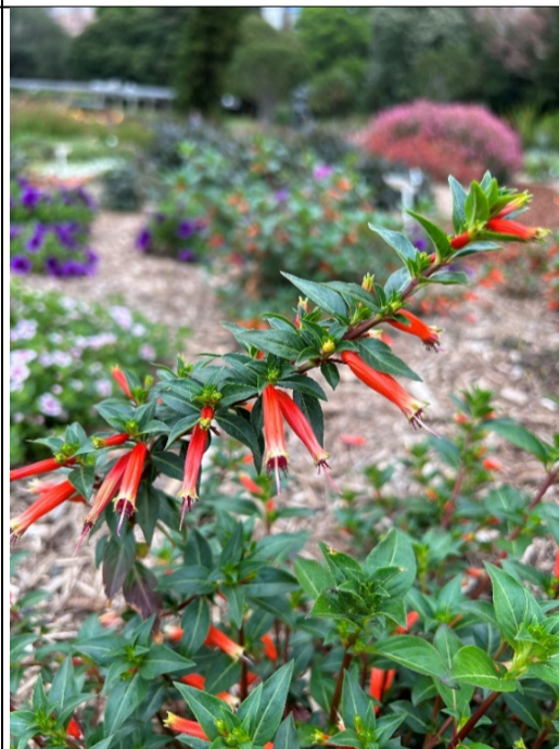
Cuphea ilavea 'Vermillionaire'

A tropical shrub that features vibrant red-orange tubular flowers, which bloom continuously. This low-maintenance, fast-growing perennial attracts bees, birds and butterflies. It reaches a height of 30 to 90 cm and spreads 30 to 45 cm, making it ideal for garden beds, containers, and hanging baskets. Thriving in full sun and well-drained soil, it adds colourful accents to landscapes with its bushy, compact growth.