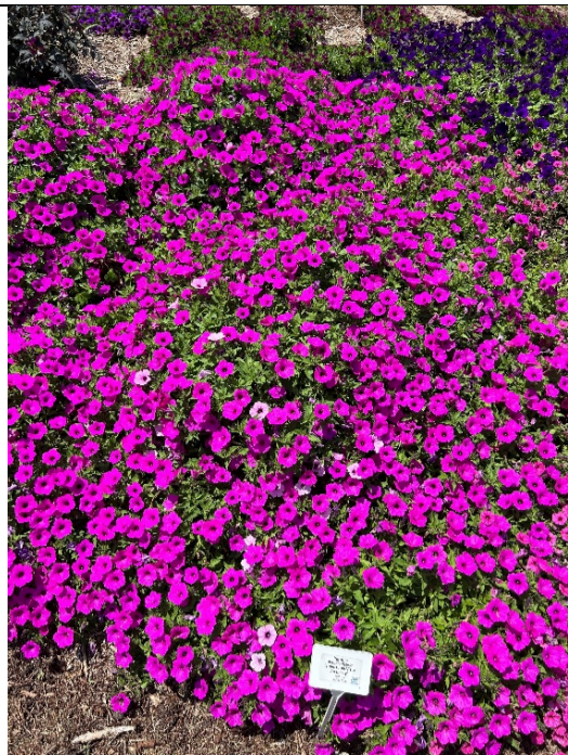
Petunia hybrid 'Supertunia Jazzberry'