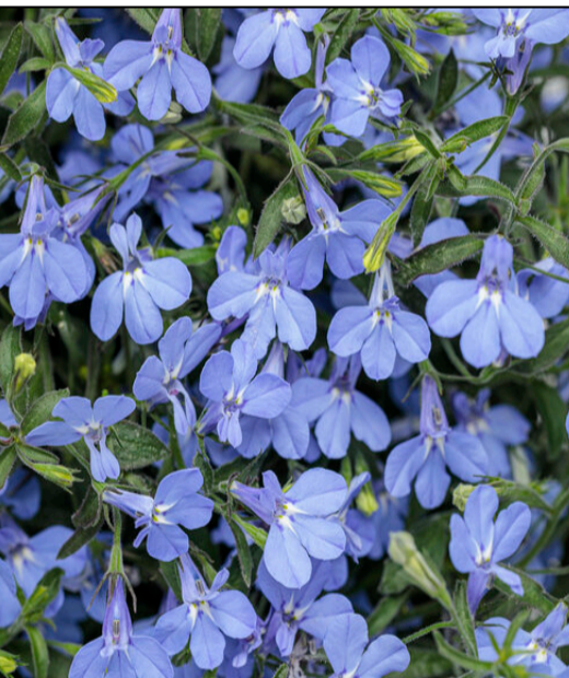
Lobelia erinus 'Laguna™ Sky Blue improved'

A compact, trailing annual known for its prolific and vibrant sky-blue flowers. This variety features enhanced blooming performance and increased vigour, making it a standout in garden beds, containers, and hanging baskets. The delicate flowers contrast beautifully with its lush, green foliage, creating a striking visual effect. 'Laguna™ Sky Blue Improved' thrives in full sun to partial shade and is admired for its long-lasting blooms and low-maintenance care requirements. We love it in our hanging pots.