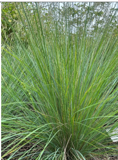
Poa spp 'Eskdale Blue'

A drought-tolerant, hardy perennial which thrives in full sun. It requires minimal maintenance once established. This Scaevola is largely different from the regular Scaevola , as it was bred from a species that grows in harsher Australian climates. It is more compact and tighter, meaning it requires far less pruning. Pink Fusion™ Scaevola is not only tough; it is also gorgeous. The compact green foliage is covered in beautiful pink fan flowers for most of the year.