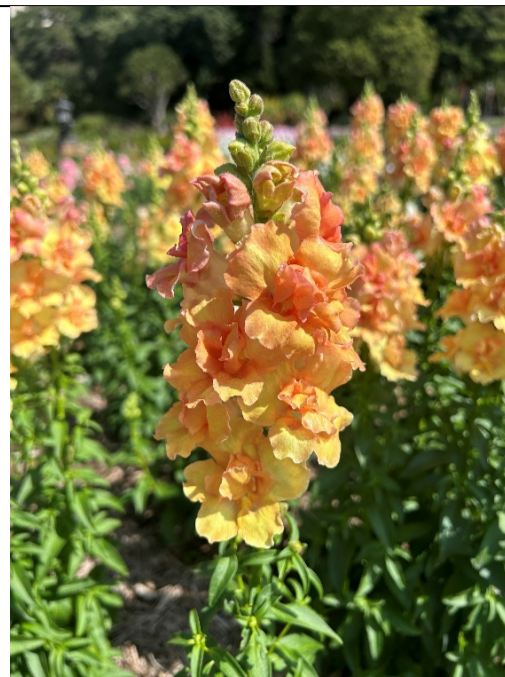
Antirrhinum majus 'Snapdragon double peach'

Snapdragon is a popular flowering plant known for its vibrant and diverse colour palette. The "double peach" variety features double-layered blossoms in a delicate peach hue, adding a lush and romantic touch to gardens. These plants have tall, spiky stems covered in multiple blooms. Snapdragons are versatile, thriving in both garden beds and containers, and they are particularly favoured for their long blooming period and ability to attract pollinators like bees and butterflies. Snapdragon double come in a range of colours. Keep deadheaded for tidy look with fresher blooms.