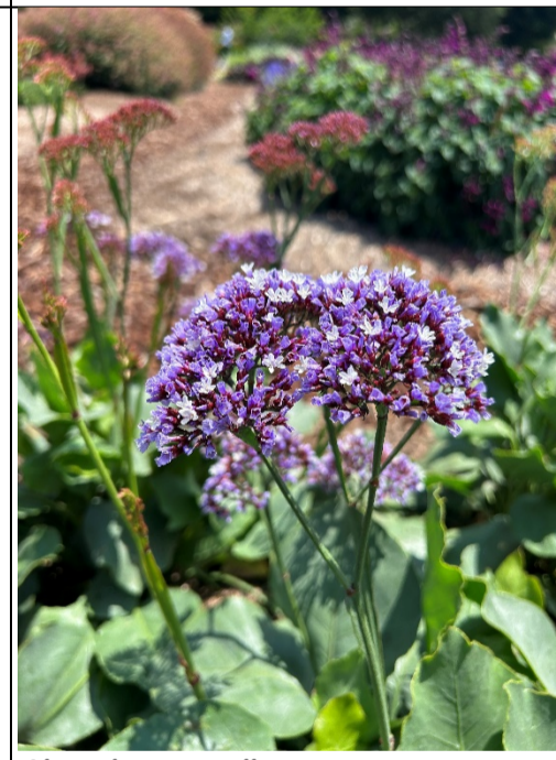
Limonium perezii 'Purple parachutes'

An ornamental perennial known for its delicate, purple flowers that resemble floating parachutes, it contrasts beautifully with its waxy, grey green foliage. Thriving in well-drained soils and sunny locations, this plant is drought-tolerant once established and often grown for cut flower due to its long-lasting blooms.