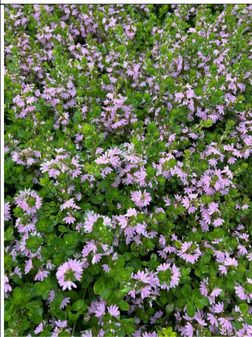
Scaevola humilis 'Pink Fusion'

A compact, bushy annual with vibrant, deep mulberry-coloured, highly fragrant flowers. It attracts pollinators like bees and butterflies and thrives in sunny garden beds, containers, or hanging baskets. The plant blooms profusely through spring, making it a low-maintenance, colourful choice for gardeners, perfect for spring and autumn displays. Responds well to a trim when flowers lessen.