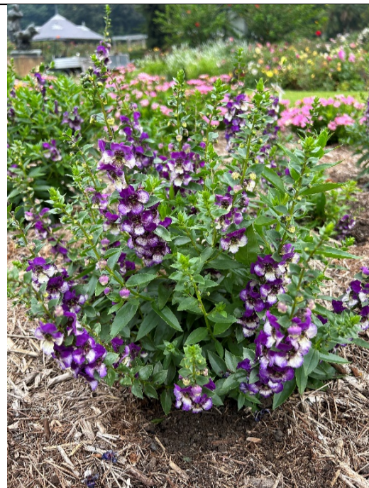
Angelonia 'Angeldance Violet Bicolour'

A vibrant annual or tender perennial with striking bicolored flowers of deep violet and white. Blooming from late spring through autumn, it thrives in full sun and well-drained soil, making it ideal for garden beds, borders, and containers. Heat and drought tolerant, this low-maintenance plant adds colour and elegance to any garden. Angelonia's come in a range of different colours.