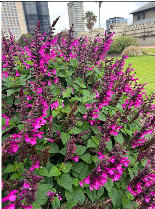
Salvia farinacea 'Unplugged pink'

A popular hybrid petunia known for its stunning, pure white flowers. This compact, trailing variety blooms profusely throughout the growing season, creating a soft, cascading effect in hanging baskets, containers, and garden beds. It is valued for its resilience, heat tolerance, and ability to thrive in full sun. The 'Snowdrift' variety is also known for its low-maintenance care, requiring minimal deadheading while still maintaining its bright, clean appearance. Its vibrant white petals offer a striking contrast against greenery, making it an excellent choice for enhancing landscapes.