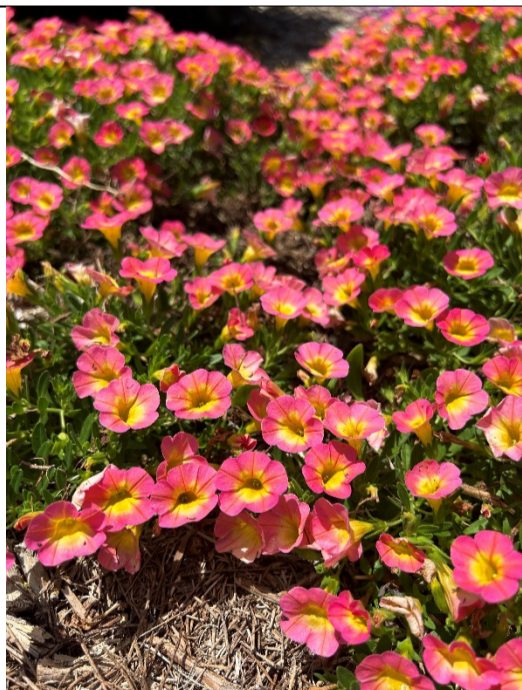
Calibrachoa hybrid 'Superbells coral sun'

A vibrant, eye-catching flowering plant known for its abundant, trumpet-shaped blooms. Each flower features a stunning blend of coral pink petals with bright yellow throats, creating a sunburst effect that adds a pop of colour to any garden or container arrangement. This hardy, low-maintenance annual is perfect for hanging baskets, garden pots and ground cover, thriving in full sun and well-drained soil. With its cascading growth habit and resistance to disease and pests, Superbells Coral Sun provides continuous colour and beauty from Spring through Autumn.