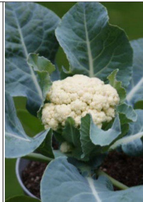
Brassica oleracea 'Cauliflower baby'

Commonly known as baby cauliflower, this miniature version of the traditional cauliflower is a delicate vegetable which features a compact head of tightly clustered, creamy-white florets atop long, tender green stems. With its subtly sweet, mild flavour it's a great alternative, particularly when space is limited.