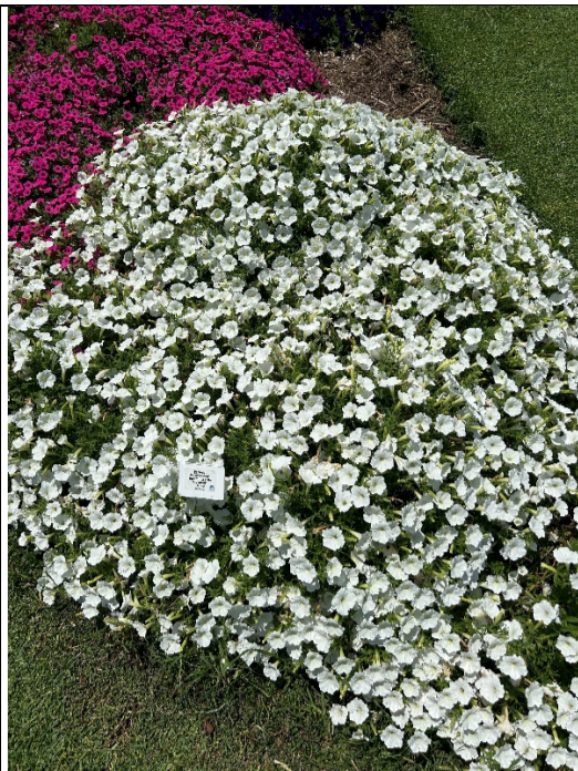
Petunia x hybrida 'Supertunia Snowdrift'

A vibrant, flowering plant known for its stunning deep pink to purple blooms. It belongs to the Supertunia series, which is recognised for its vigorous growth, continuous flowering, and compact, trailing habit. This petunia variety thrives in full sun and well-drained soil, making it ideal for containers, hanging baskets, and garden beds. Its rich colour and prolific blooms attract pollinators, adding beauty and a burst of colour to any garden or landscape throughout the growing season. The 'Jazzberry' is particularly appreciated for its heat tolerance and long-lasting performance.