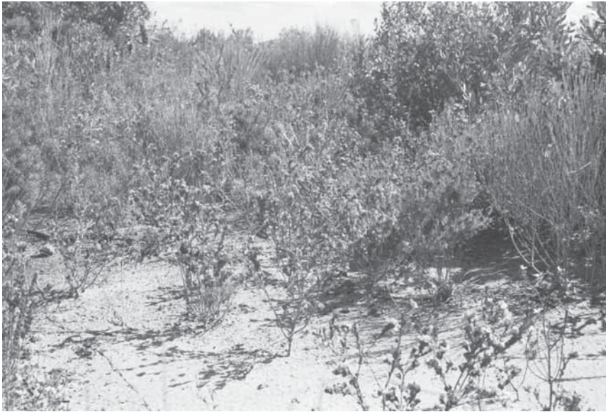
Fig. 2. Seven year old Boronia serrulata plants, mostly under 60 cm in height.