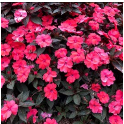
Impatiens 'Sunpatiens Compact' SAKATA

This small highly floriferous shrub flowers for most of the year, in a range of colours, was trialed in both sun and shade. Hardy and pest and disease resistant.