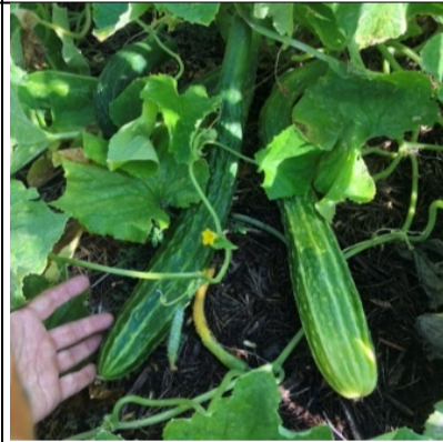
Cucumis sativus 'Suyu Long'

Medium sized shrub performs well in full sun and will add colour to seasonal borders. It dies down in cooler months but after a hard prune will return with vigour. Pest and disease free.