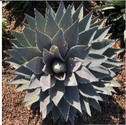
Mangave 'Lavender Lady' WaltersGardens

This ornamental cultivar of sweet potato is a great seasonal ground cover, with lime green and dark purple foliage. Will grow in full sun, to several meters across in spring and summer and die back in the cooler months. Pest and disease resistant.