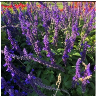
Salvia 'Blue Marvel' Ball Australia

Large shrub grows over 1.5m with vibrant light red flowers accented with plum coloured bracts. Continuous flowering throughout the year. Responds well to pruning. Pest and disease free and best suited to sunny positions.