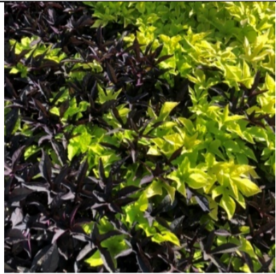
Ipomoea 'Bright Ideas' series Propagation Australia

A small compact shrub that flowers continuously and responds well to pruning. Strikingly contrasting flowers and foliage, grows in full sun and is pest and disease resistant.