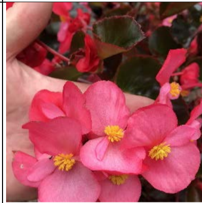
Begonia 'Megawatt' series

This kangaroo paw stands at 1m when in flower. Great numbers of golden yellow flowers from spring through to late summer. Responds well to pruning and is pest and disease resistant.