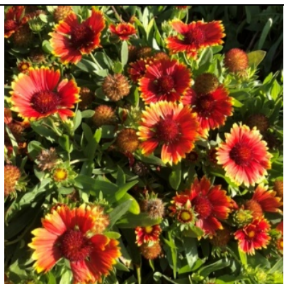
Gaillardia 'Galya' DANZIGER

This cultivar also featured in the 2019 Plant Trial Winners and it continues to impress, throwing out bright red and yellow daisy like flowers. The seed heads forming fluffy orbs are also an ornamental feature. Bright green foliage. Heat and drought tolerant.