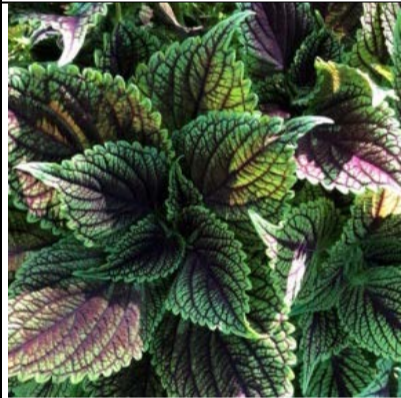
Coleus 'Copper Ruffles'

Fast growing screen/hedge. Almost looks like it is covered in snow with masses of white heavily perfumed flowers in spring. The amazing fragrance of the flowers can be detected up to 50m away.