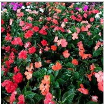
Impatiens 'Beacon Mix' PanAmericanSeed

This cultivar performed well in sun and shade. It develops a prostrate habit in shade and a compact bun habit in full sun. They die down over winter but were back in flower once the soil has warmed up.