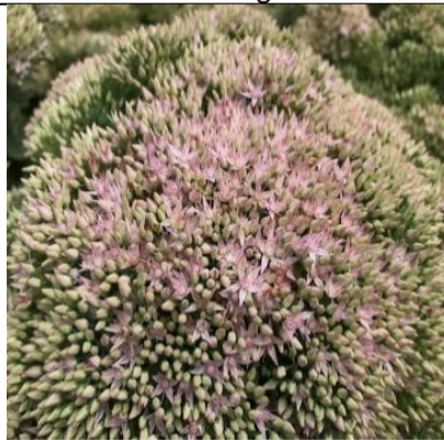
Sedum 'Pure Joy' AFG

Small shrub grows to 1m high with bright white flowers that last for several months over spring and summer. Sun loving and pest and disease resistant.