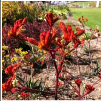
Anigozanthos 'Kings Park Federation Flame'

Medium sized shrub, floriferous and long flowering through spring and summer. Silvery green foliage, responds well to pruning and pest and disease resistant.