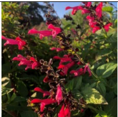
Salvia 'Amante' AFG

Floriferous and vibrant flowers similar to peonies or roses in reds, yellows and purples. This mix flowered for three months in spring. Resistant to pest and disease, and only succumbed to powdery mildew towards the end of their season. Responds well to deadheading.