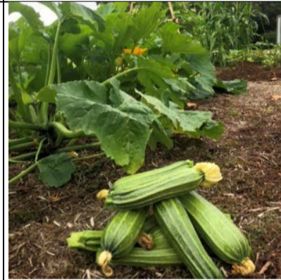
Cucurbita pepo 'Costata Romanesco'

This climbing cucumber variety is pest and disease resistant. A heritage cultivar with attractive long fruit that are juicy and crunchy. From 6 plants our yield was 24 fruit with a total weight of 15.2 kgs with more to come in late summer.