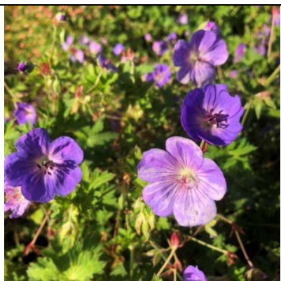
Geranium 'Rozanne' AFG

This cultivar also featured in the 2019 Plant Trial Winners and it continues to impress, throwing out bright red and yellow daisy like flowers. The seed heads forming fluffy orbs are also an ornamental feature. Bright green foliage. Heat and drought tolerant.