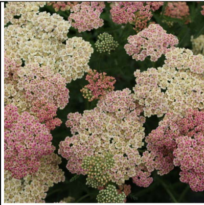
Achillea 'Pineapple Mango'

In the hibiscus family, okra is an annual vegetable, both ornamental and productive. Red and green fruited varieties were trialed, growing to 1.3m. They are drought tolerant and pest and disease resistant.