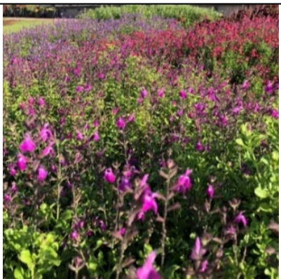
Salvia greggii 'Mesa' series syngenta

Medium sized shrub grows to 80cm high with long lasting flowers. The flower spires are a vibrant blue with purple bracts. Responds well to pruning and is pest and disease free. Best suited to sunny positions.