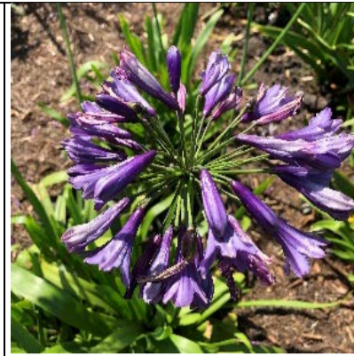
Agapanthus 'Poppin' Purple'

A slow growing compact dwarf Agapanthus that is slow growing and less invasive than older varieties. With a smaller sized deep blue flower. Pest and disease free. Useful in borders due to its smaller stature.