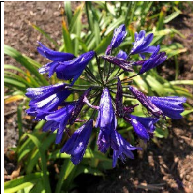
Agapanthus 'Blue Thunder'

Held its flowers for a long period with a good colour contrast between the flower and foliage making it a standout. Responded well to a hard cutback after flowering.