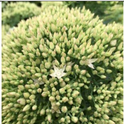
Sedum 'Thundercloud' AFG

This lovely mounding succulent performed very well in a dry bed in full sun. Would be perfect for a dry rockery. Lovely tiny pale pink flowers completely covering the grey-green foliage.