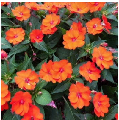
Impatiens 'Sunpatiens' SAKATA

A small hardy shrub, trialed in shade and full sun, is pest and disease resistant and quite drought tolerant. Continuous flowering in a mix of white, purple, pink, orange and red flowers.