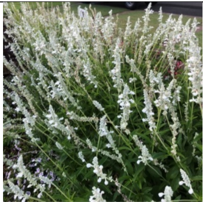
Salvia 'White Flame' Ball Australia

Medium sized shrubs in shades of purples, reds, blues and pinks. Growing to a height of 1.2m. With good pest and disease resistance, they flower profusely over the warmer months. Responds well to pruning.