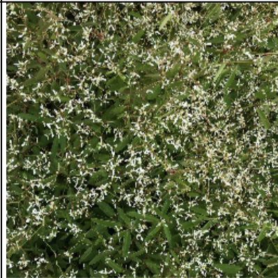
Euphorbia 'Diamond Frost'

A tight growing form of Dianella with a greyish/glaucous appearance. Useful as a landscape plant especially in low water situations. Pest and disease resistant.