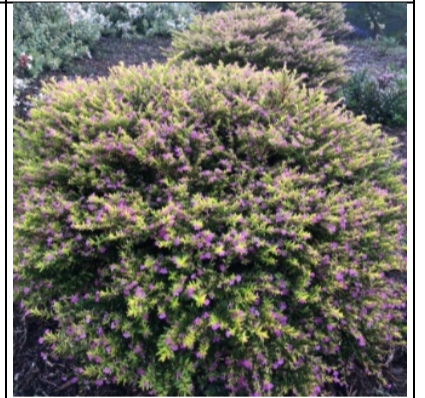
Cuphea 'Cupid' series

An impressive structural plant for the vegetable plot growing 1m by 1m. Resistant to powdery mildew until late in the season. The fruit is a mild flavour with good texture after cooking. Produced 42.30 kgs of fruit from 6 plants.