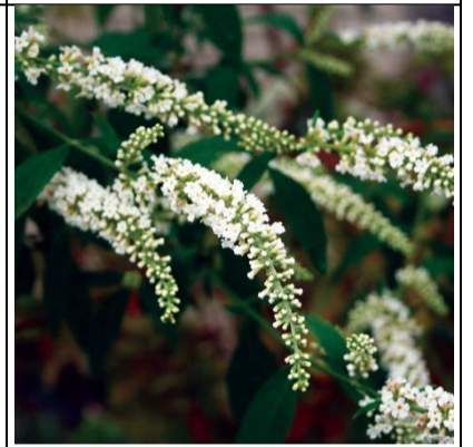
Buddleja 'Spring Promise'

This collection of warm coloured Begonias produces long lasting flowers in a range of pinks. Foliage varieties in both green and bronze, perform well in full sun growing to a height of 80cm. Responds well to pruning.