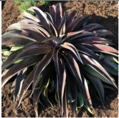
Mangave 'Mission to Mars' WaltersGardens

Beautiful structural plant ideal for low water gardens. Distinct light purple coloured foliage with a glaucous appearance. The spines on each leaf tip fold in on themselves making this safer around pets and children. Tolerates direct hot sun and is pest and disease resistant.