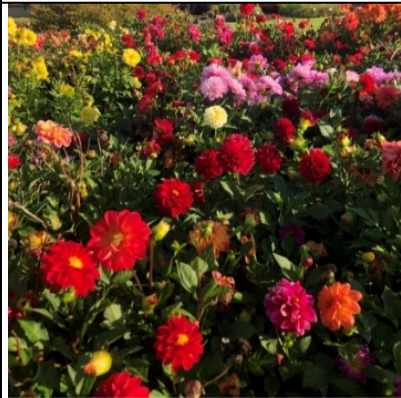
Dahlia 'Dalaya' series

Small to medium compact mounding shrub with little pruning. Pest and disease resistant. Summer flowering in a range of colours, the lime green foliage is useful in the landscape all year.