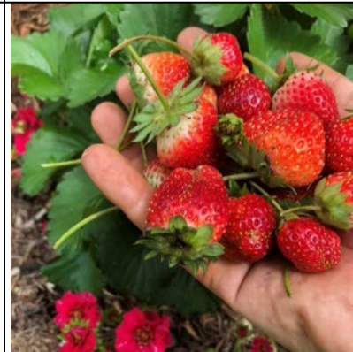
Fragaria x ananassa 'Summer Breeze Rose'

These delicate and floriferous plants grow into mounds 1m wide and 50cm high. Small white flowers dust the entire plant for much of the year. Pest and disease free.