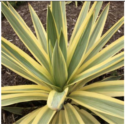
Yucca 'Citrus Twist' SPRINT Horticulture

This series produces a great display of flower colour and shape. We trialed the range of gold, yellow and orange. The plant is consistently uniform in size and shape making it useful for bedding displays. Pest and disease free.