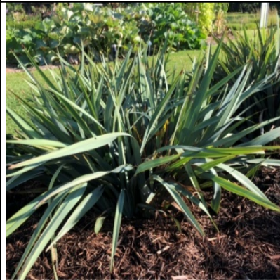
Dianella 'Blue Ripple'

This pest and disease resistant cultivar will grow to 70cm and comes in a wide range of warm colours. Does not require deadheading for continued flowering and performs well in full sun. This series also featured in the 2019 Plant Trial Winners.