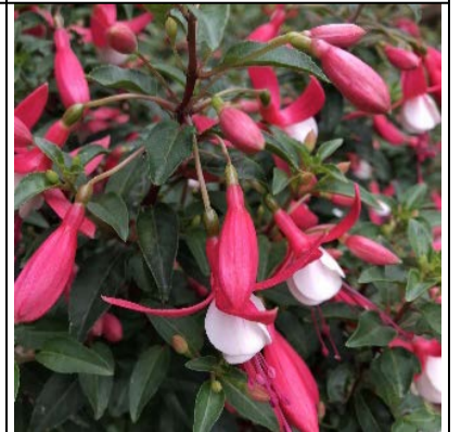
Fuchsia 'Bella Evita'

A bright red flower followed by medium sized mild flavoured fruit makes this strawberry cultivar both ornamental and edible. It has an attractive tight bun shape making them a feature plant, with good pest and disease resistance.