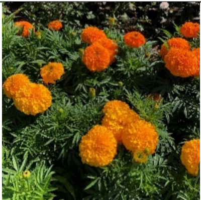
Tagetes 'Diamond' series Highsun Express

This lovely succulent forms a compact mound habit to 30cm in height. Is covered in pale pink to white flowers and has attractive grey-green foliage for a year-round display. Prefers dry rockery situations in full sun.