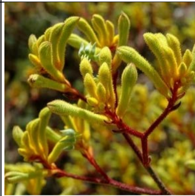
Anigozanthos 'Landscape Gold'

Vibrant burnt orange coloured flowers coupled with glaucous strappy leaves make this a dramatic landscape plant for low water gardens. Flowering from spring until early summer. Pest and disease resistant.