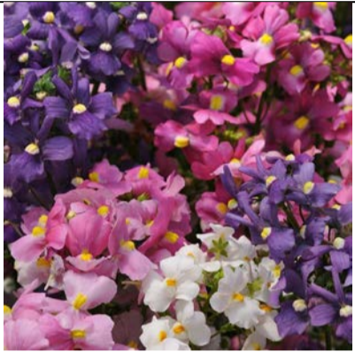
Nemesia 'Poetry' Series Ball Australia

Soft green leaves with red spots and a glaucous appearance. Great structural plant for low water gardens. Tolerates direct hot sun. Pest and disease resistant. This spineless variety is child and pet friendly.