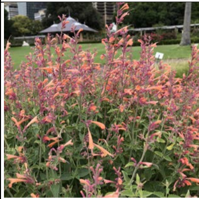
Agastache 'Summer Crush'

Light blue flowers and variegated foliage makes this cultivar interesting all year around. A hardy plant that retains few dead leaves and is pest and disease resistant.