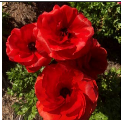
Ranunculus 'Mache' mix syngenta

Osteospermum are best grown as biennials in Sydney. This cultivar performed well but is extra-special due to the parchment brown, almost peach coloured flowers. Pest and disease resistant.