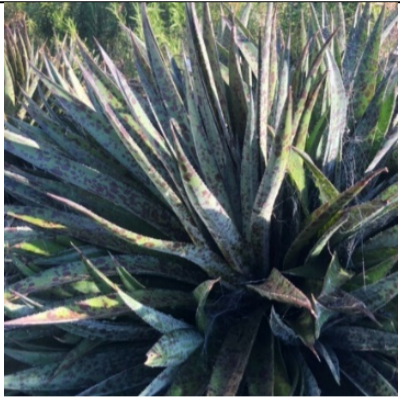
Mangave 'Pineapple Express' WaltersGardens

Dramatic red and green structural plant 1m across. Low water requirements and can tolerate direct hot sun. Pest and disease resistant.